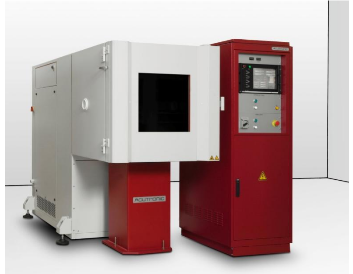
Series AC1125 with TC (mechanical refrigeration)