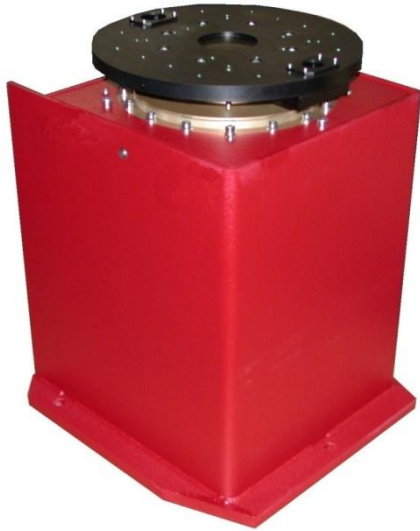
Series AC1125 with 415 mm diameter Table Top